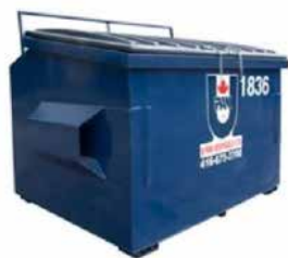
4 Yard Bin