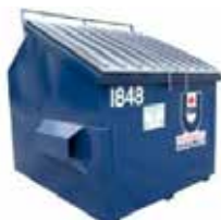
'Easy Load' Slant 8 Yard Bin