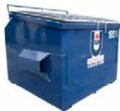
'Easy Load' 6 Yard Bin

Perfect for mid size restaurants and companies