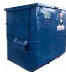
Dock 8 Yard Bin

To eliminate contamination from the recycle