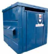
Slotted Recycling 8 Yard Bin