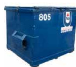
6 Yard Bin