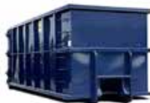
40 Yard Roll Off Bin

22' x 4' x 8' Perfect for heavy debris, large home renovations or clean outs