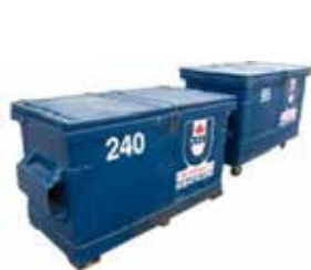
2 Yard Bin

Designed for commercial, industrial and institutional applications.