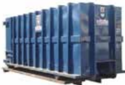
40 Yard Compactor Bin

22' x 8' x 8' Perfect for construction sites or home renovations